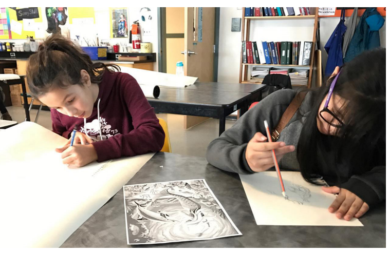
dle School. The Art Show will highlight visual and digital art, band, choir, drama and more. For more information about the show, visit the school website at www.sjasd.ca/school/georgewaters