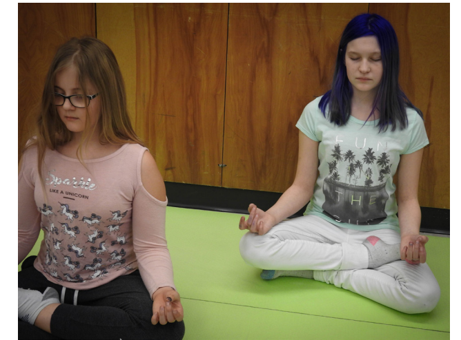
Positive mental health is a priority at Hedges Middle School and this is another way to help ensure students have the tools they need to lead happy, healthy and inspired lives.

With two classes exploring these practices, there is also a school-wide Yoga Club offered by Ms. Dueck on Thursday mornings before school open to all students and staff in the building. It is evident students are starting to apply the new concepts they have learned through yoga and meditation to other situations/aspects of their lives, such as when they need to reflect, relax or simply take a deep breath.