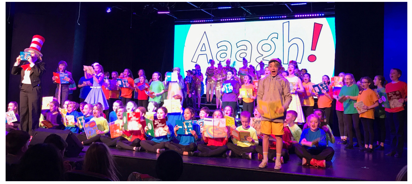
Cast 1 during the opening scene of Seussical the Musical Jr. presented inside the Westwood Collegiate theatre.

specific exhibits, people, points of interest and most importantly, ways to put their new-found ideas into practice to promote inclusivity at their schools. Students demonstrated high levels of engagement throughout the day as they sought out conversations with key note speakers, asked for clarification, answered questions and filled out their knowledge quests with many new ideas to bring back to their school communities. Great job to all students and staff. Thank you to the speakers, museum liasons, coordinators, senior administration and Board of Trustees for supporting and contributing to the success of this year's SJASD Youth Forum!