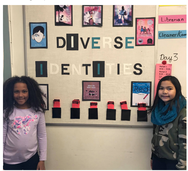
chose, One Crazy Summer , motivated her to want to stick up for other people if someone is unkind or mean. Collectively, Stevenson-Britannia is enjoying this theme of diverse identities as it speaks to our students, our families, and our community. We are all diverse. We are all important. We all belong. Submitted by Stevenson Staff

gles. Thank you to Parent Council, Phoenix families and the school division for supporting this special learning experience for our students and staff.