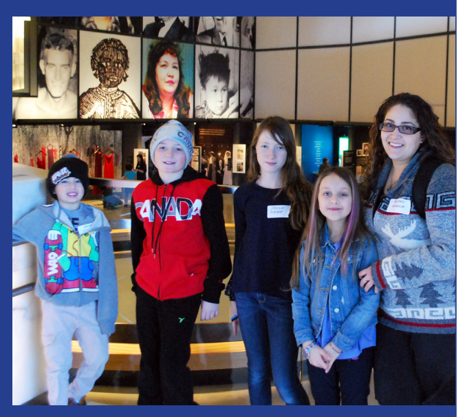
Youth Forum at Canada Museum for Human Rights Page 6