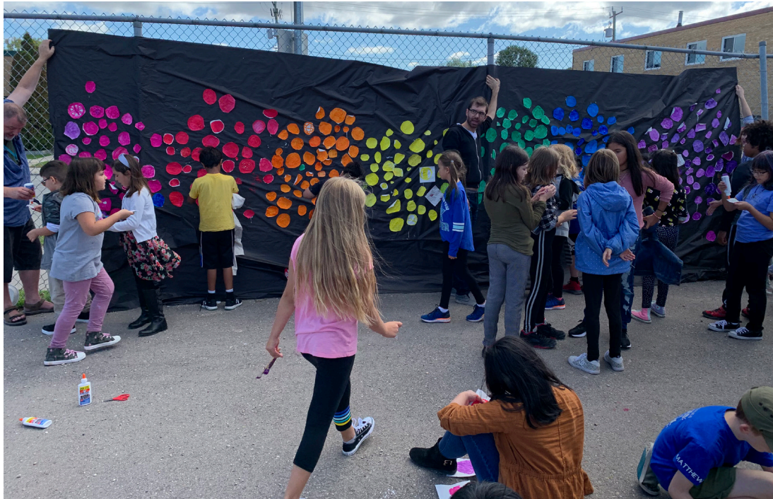
Students and staff creating a group art installation in the school yard on International Dot Day.