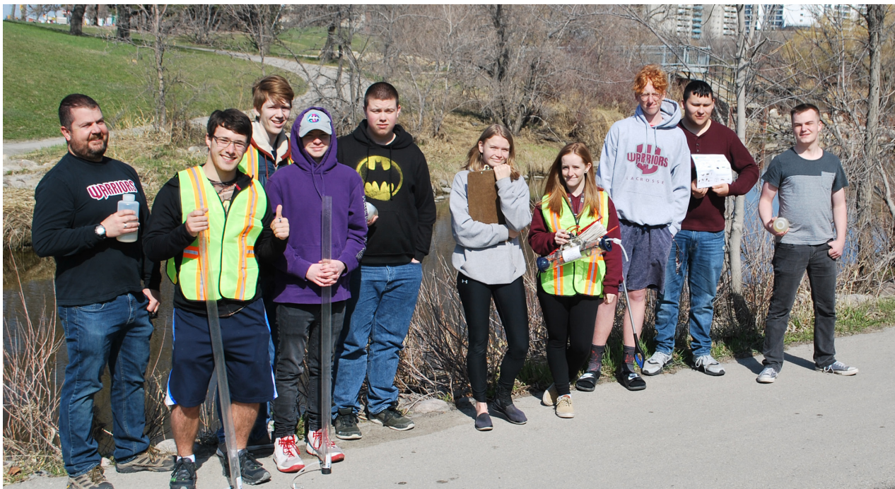
Westwood Collegiate students gathering water samples in partnership with the FortWhyte Alive River Watch Program and the Lake Winnipeg Foundation in June.

Sign up to receive our CONTACT newsletter via email by visiting WWW.SJASD.CA