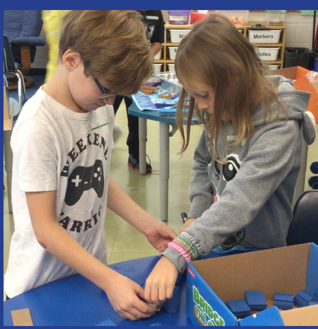
STEM learning on the rise at Voyageur School Page 4