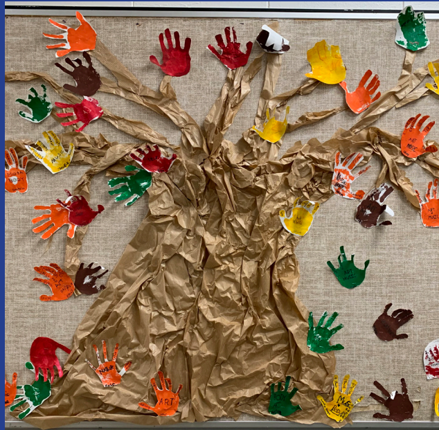
Art projects promote student identities at Stevenson Page 3