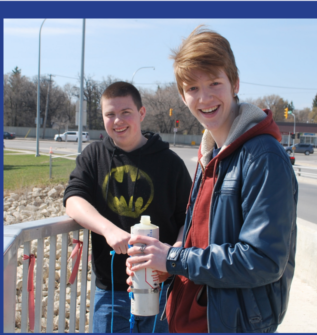
Westwood part of province-wide water-testing initiative Page 2