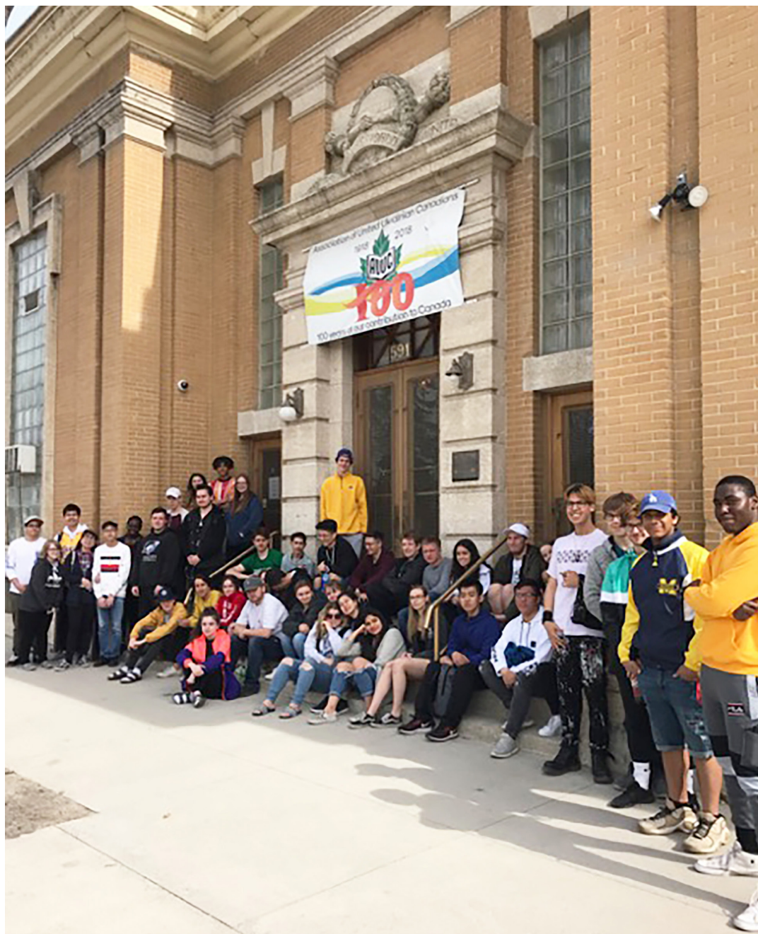
Collège Sturgeon Heights Collegiate students at the Association of United Ukrainian Canadians as part of their 100th Anniversary Winnipeg General Strike tour.