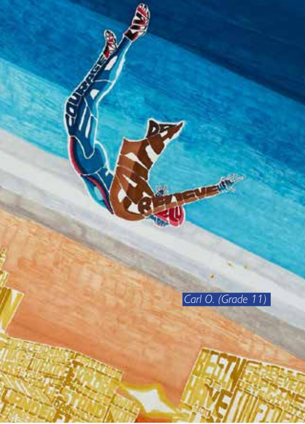
Carl O. (Grade 11)