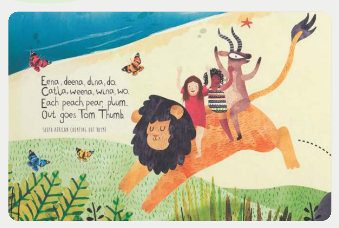
This resource is licensed under Creative Commons BY-NC-ND

Reading provides children with a wide range of ideas, views and experiences.