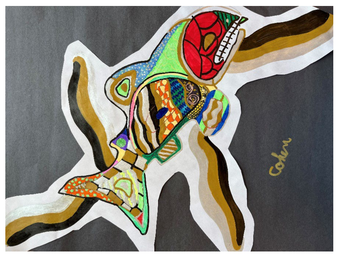
Cohen C. 2<sup>nd</sup> Place