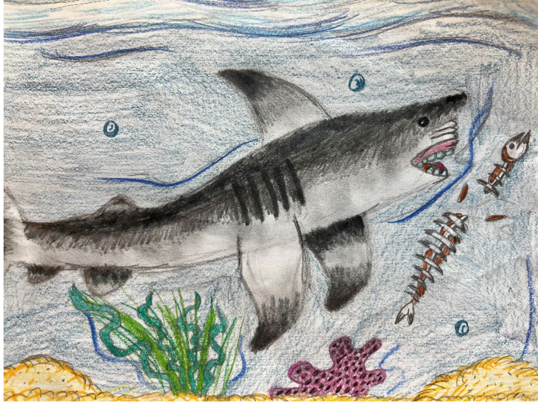
Caitlin B. 3<sup>rd</sup> Place