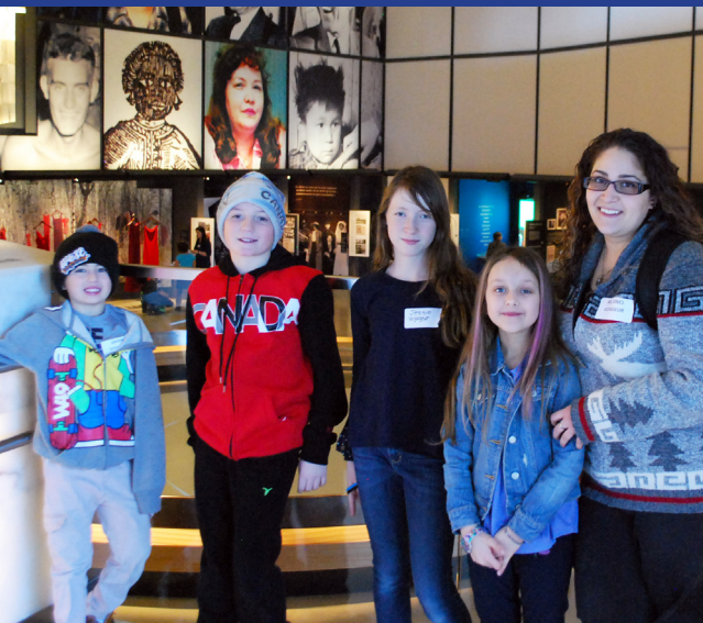
Youth Forum at Canada Museum for Human Rights Page 6