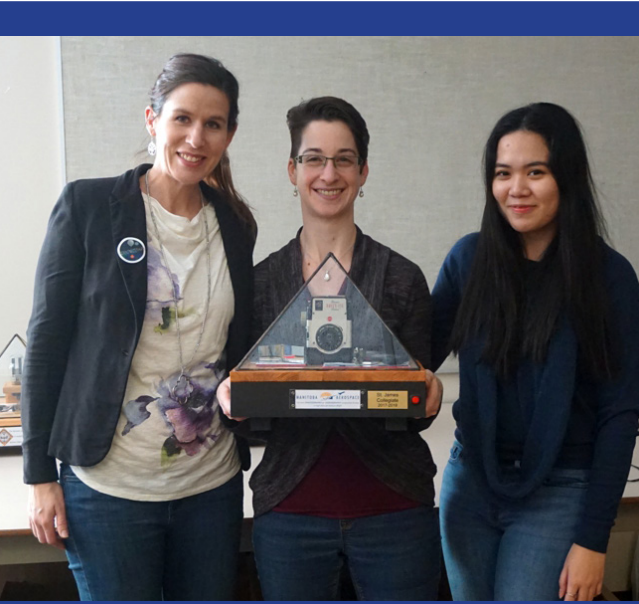
Space Jimmies earn Best Video/ Photography Award Page 5