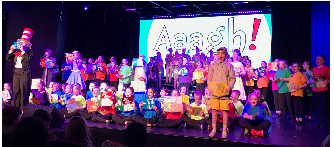
Cast 1 during the opening scene of Seussical the Musical Jr. presented inside the Westwood Collegiate theatre.