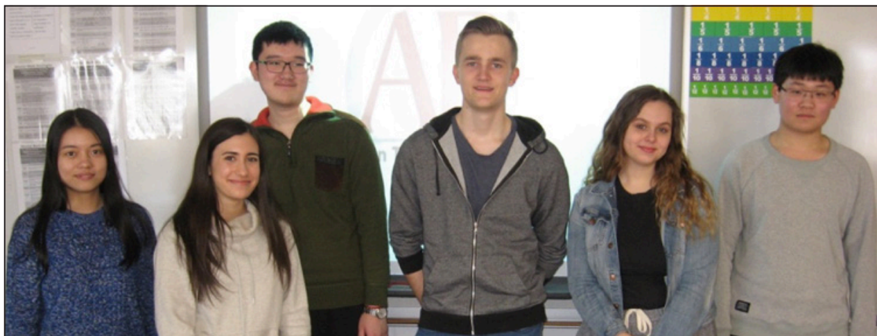
The Advanced Placement Calculus Group for the class of 2018 at John Taylor Collegiate.

chose, One Crazy Summer , motivated her to want to stick up for other people if someone is unkind or mean. Collectively, Stevenson-Britannia is enjoying this theme of diverse identities as it speaks to our students, our families, and our community. We are all diverse. We are all important. We all belong. Submitted by Stevenson Staff