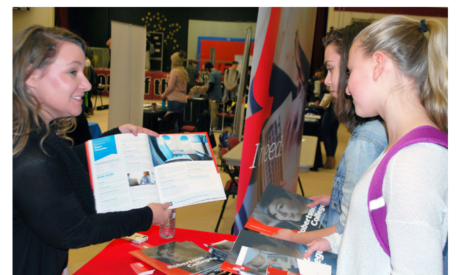
Westwood Collegiate students at the Robertson College booth picking up additional information.