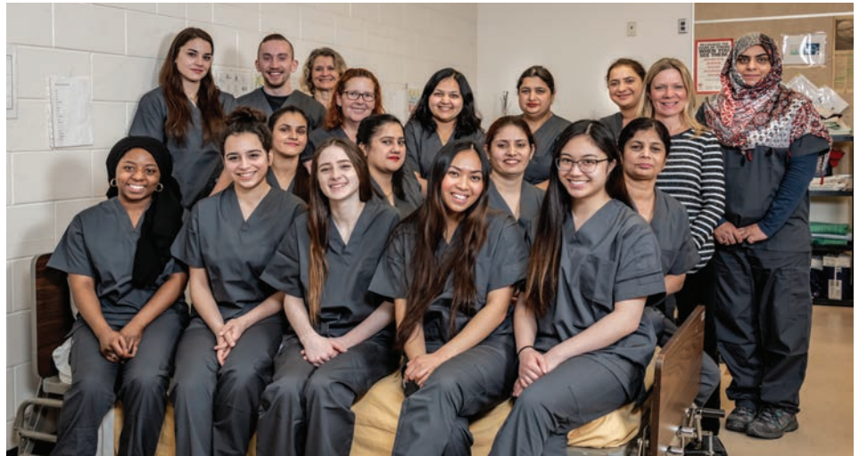
Health Care Aide Class - Fall of 2018