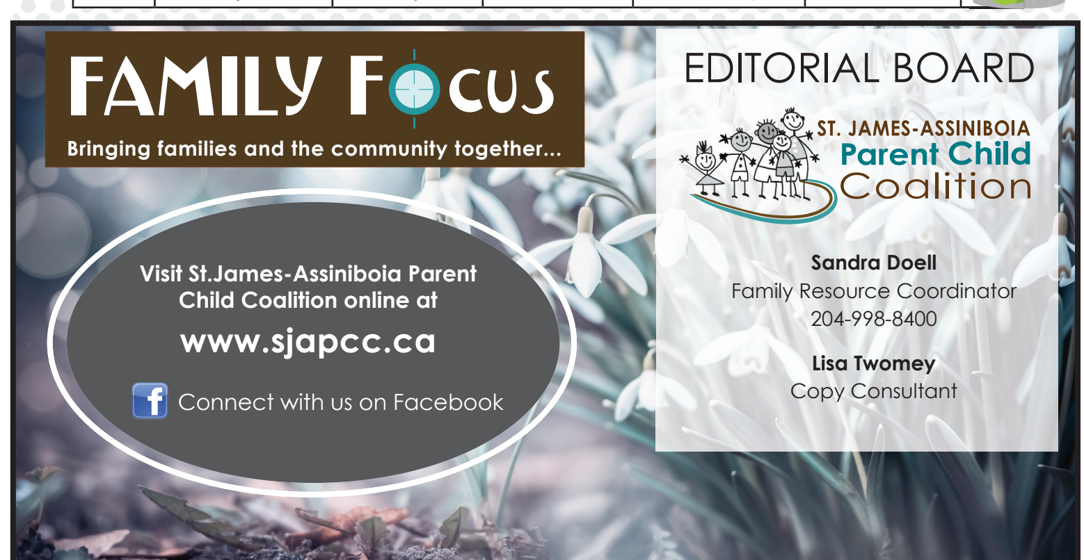
Family Focus Summer Issue will be available June 2019