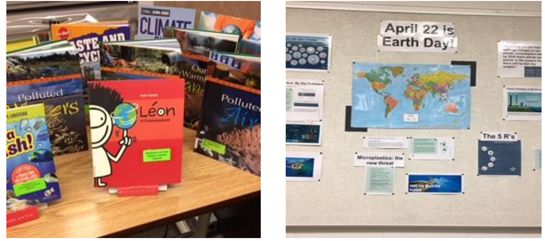
Earth Day displays in Ness Library