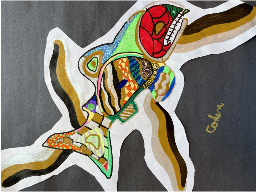
Cohen C. 2 nd Place